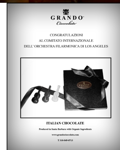
Created for the L.A. Philharmonic International Committee