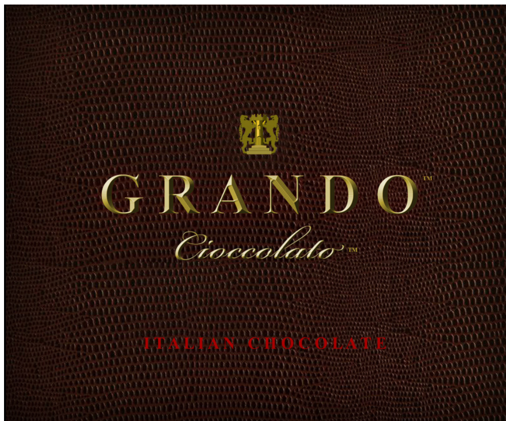
Table Of Cioccolato