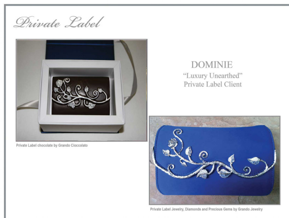
Grando Cioccolato Custom Chocolate Purses Grando Jewelry Custom Purses

Academy Award Winning Producer Jon Landau commissioned Grando Cioccolato to produce a 3D custom solid Italian Chocolate replica of his family for their 2013 "Sweet Holiday" Gifts.