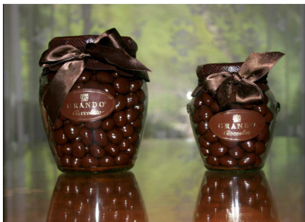
GC Espresso Pearls™

Espresso Beans coated in Dark Cioccolato