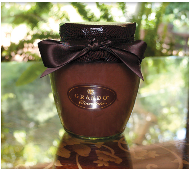
GC 22 kt. Gold Dust™