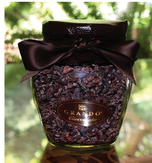
GC 24 kt. Cocoa Nuggets™

100% Natural Italian Roasted Cocoa Beans