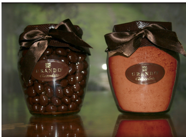
Gift Set of Tureens